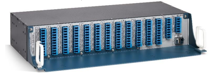
Cisco NCS 1001 Mux/Demux Patch Panel

The Mux/Demux 64-Channel Patch Panel is a standalone passive unit that contains both a 64-channel optical multiplexer and demultiplexer, pre-cabled within the unit's housing. This filter is designed with optimum tradeoff between bandwidth and isolation for a network designed with 64 channels of 400ZR.