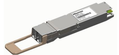
OSFP 800G SR8 LPO