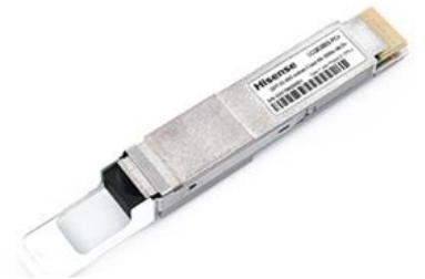
QSFP-DD 400G ZR+

Hisense Broadband is a global technology leader in Optical Chips, Laser Transceivers and Terminal Devices with over 20 years of experience in the Industry.