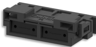
ELSFP Module Connector