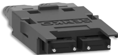
ELSFP Host Connector