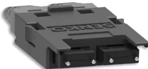
ELSFP Host Connector